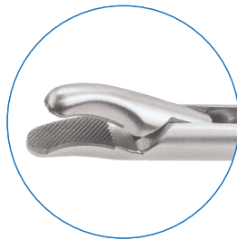
Curved w/TC Inserts