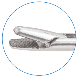
Straight w/TC Inserts