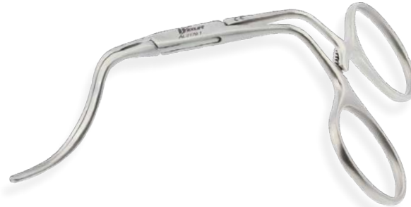
Micro Coarctation Clamp