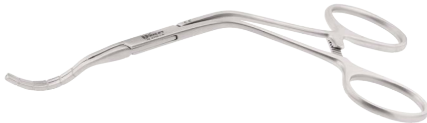
Wexler Baby Vascular Clamp