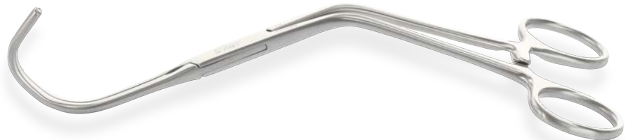
Lambert-Kay Aorta Clamp